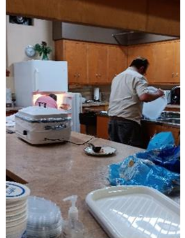
Busy in the kitchen